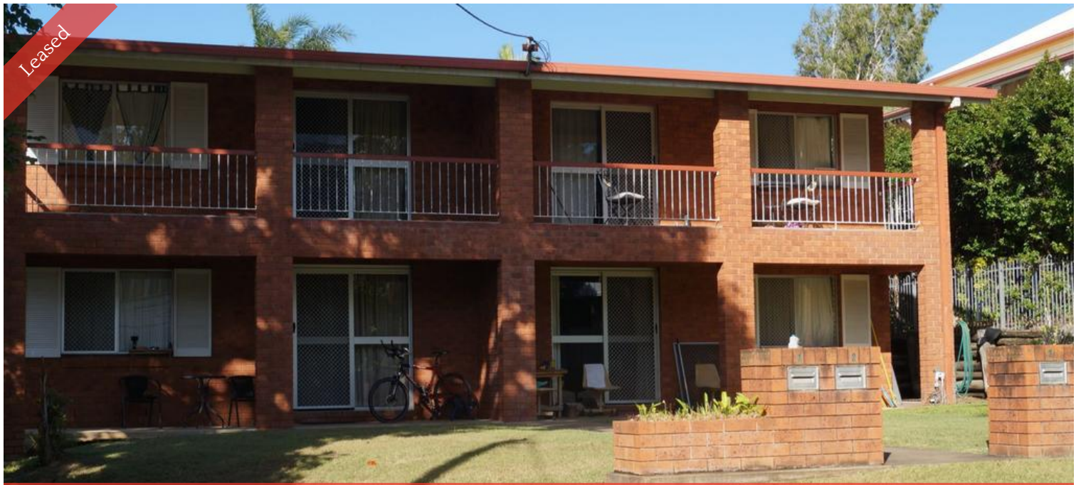
Unit 3, 5 Wiseman Street, Allenstown